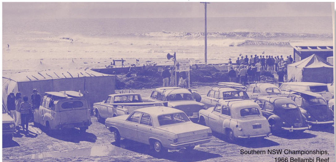
Southern NSW Championships, 1966 Bellambi Reef