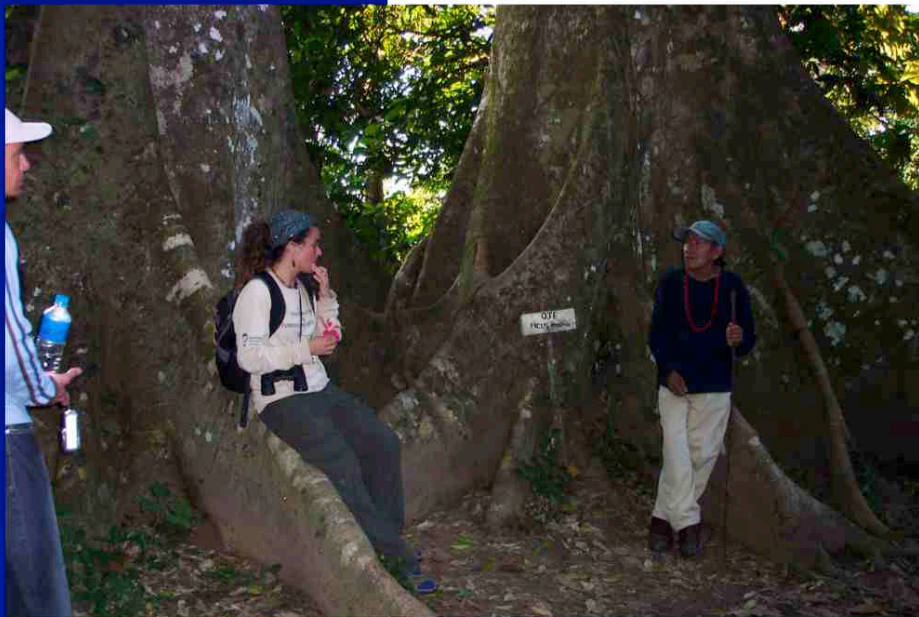
The New York hipsters pay a lot of money for this famous Amazon medicine man's potions. We got a couple for free!