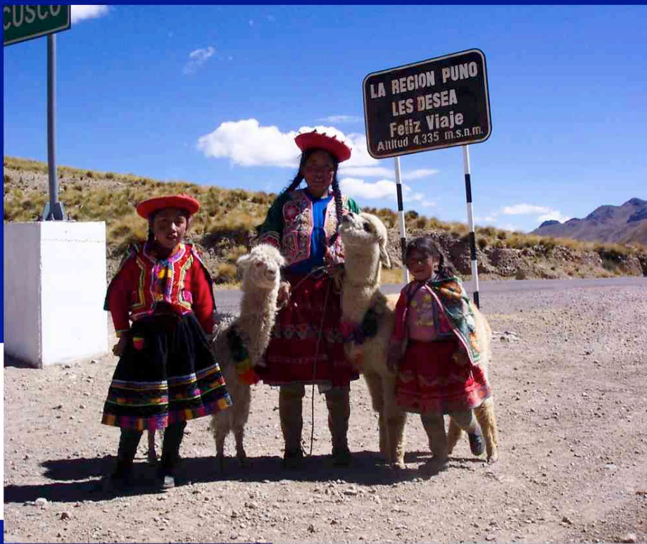
Locals heading into town - at 4300m the air is a bit thin!