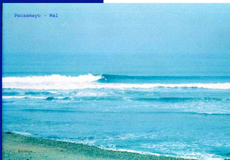
Pacasmayo - Mal

"Have knife" the bandit said as he pointed his 12inch knife at me from 12inches away."