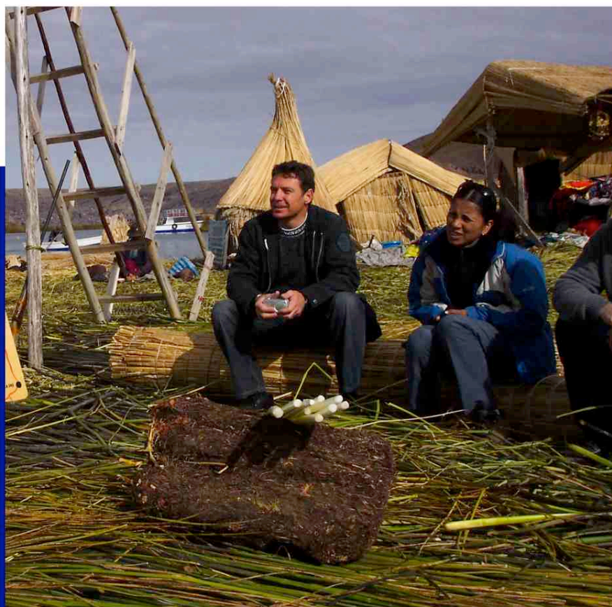
Thatched reed island