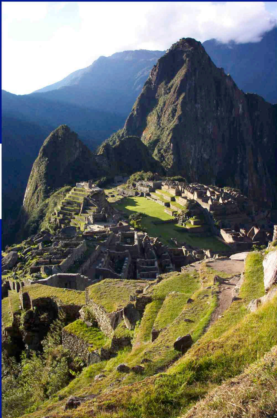
Coming into Macchu Piccu