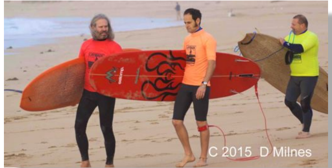
C 2015 D Milnes