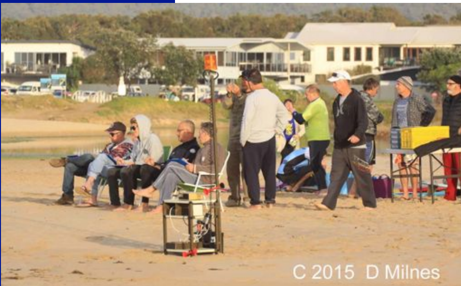
C 2015 D Milnes