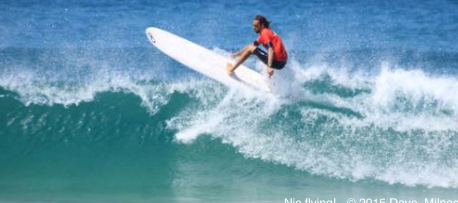
lic flying!