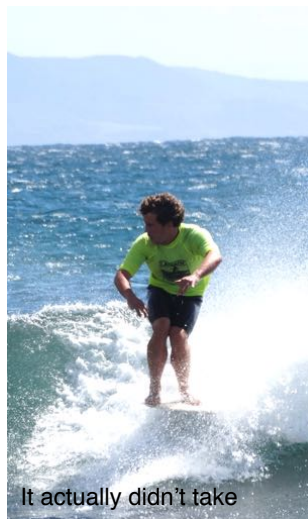
It actually didn't take