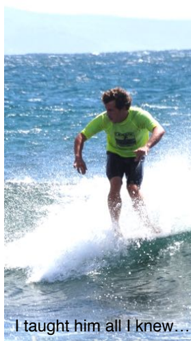
I taught him all I knew...