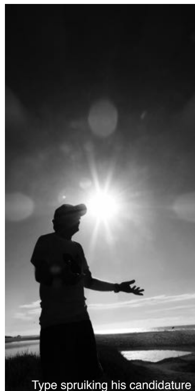
Type spruiking his candidature