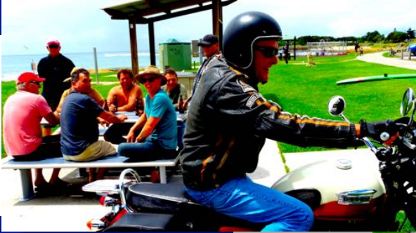
Greeny demonstrating common errors of the modern rider