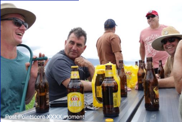
Post Pointscore XXXX moment