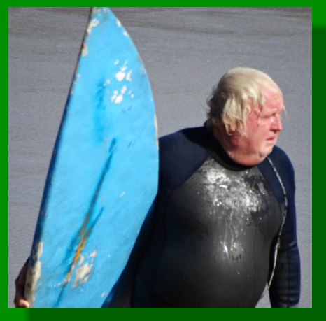
COLZA COLZA COLZA!!