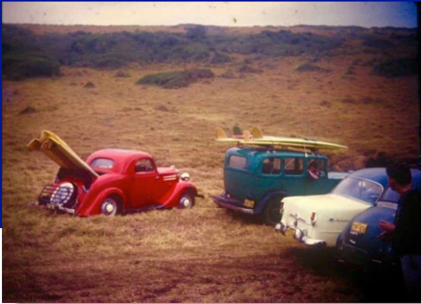
Surfers and their classic rides at The Farm, Killalea Beach in the 1960's