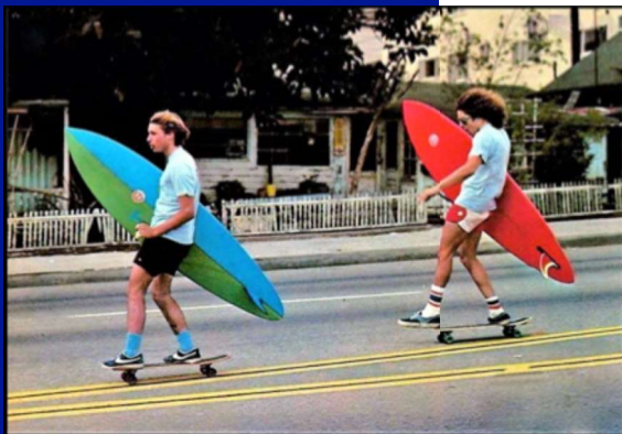
How cool is this shot of two friggen absolute dudes. Jay Adams & Tony Alva . . . 1978