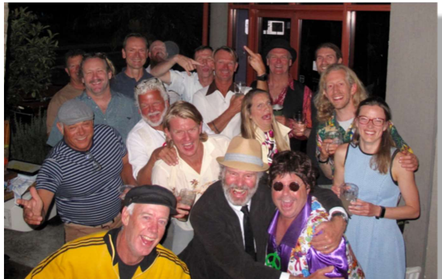
2018 Presso night at Tyse's Delano Cafe