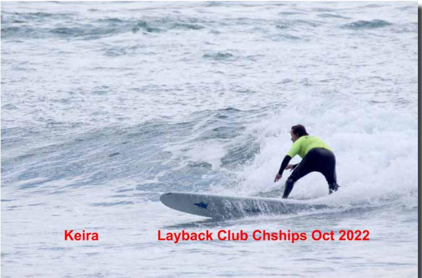
Keira Layback Club Chships Oct 2022