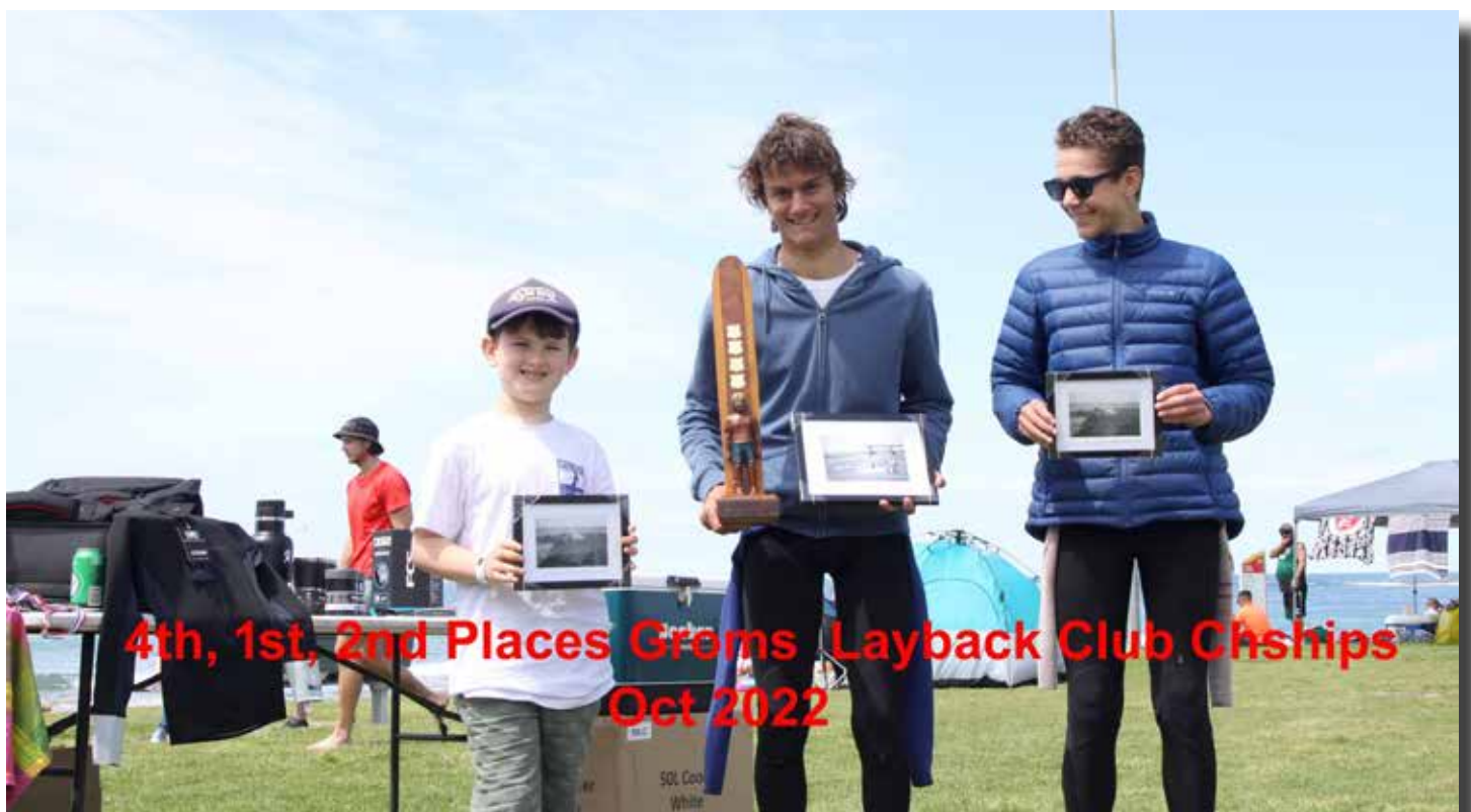
4th, 1st, 2nd Places Groms Layback Club Chships Oct 2022