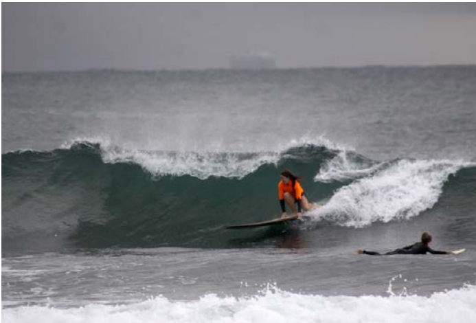
Georgia Eastmont- Ladies