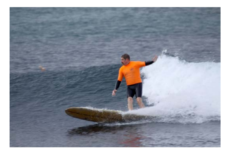
Hugh Jass- Old Mal