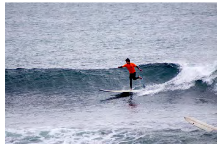
Gus Battestini- Groms