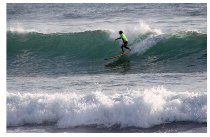
Russell Grey- Opens