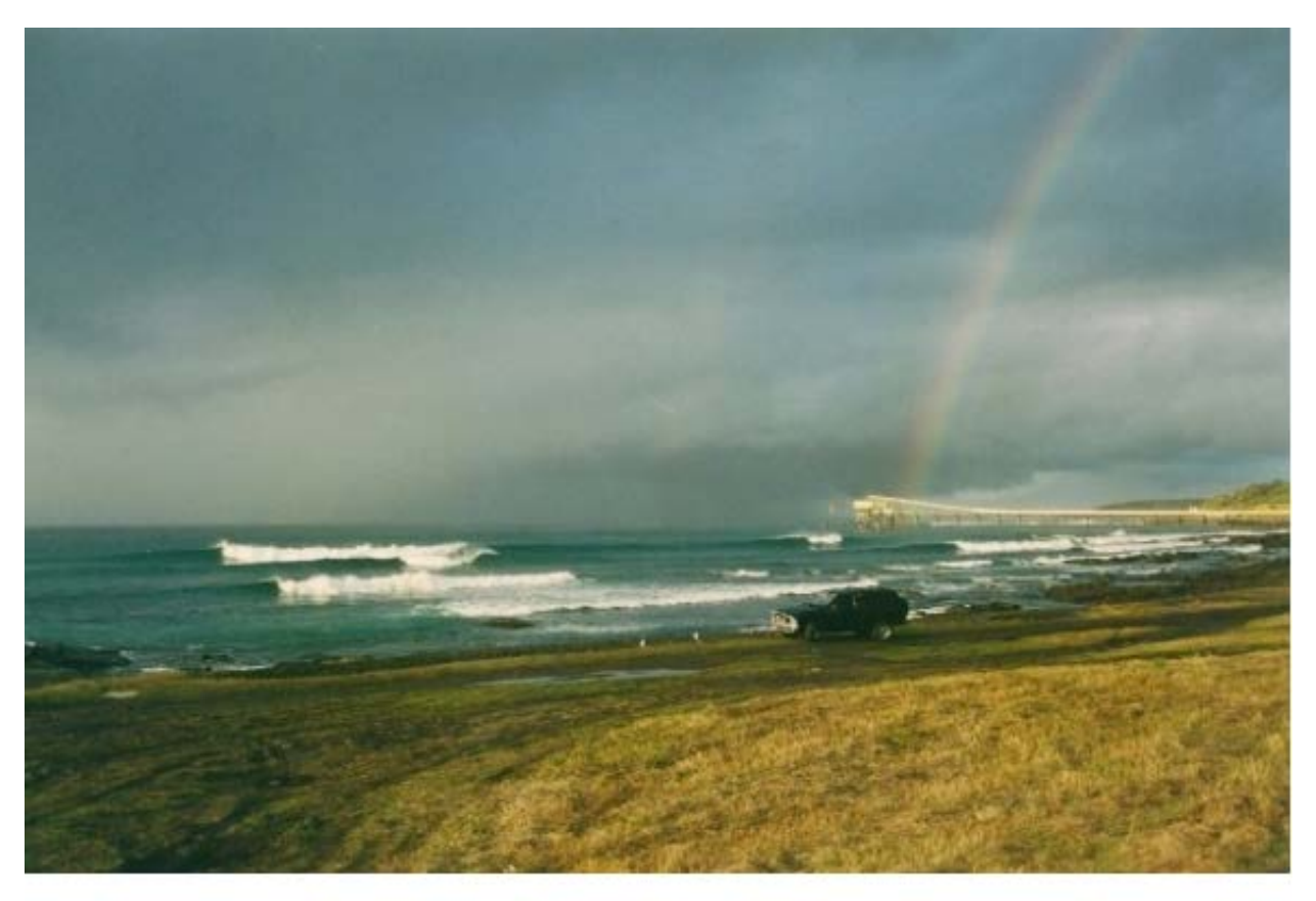
After a surf, around 1996. Taken as we were leaving (not my car)... PERFECTION!